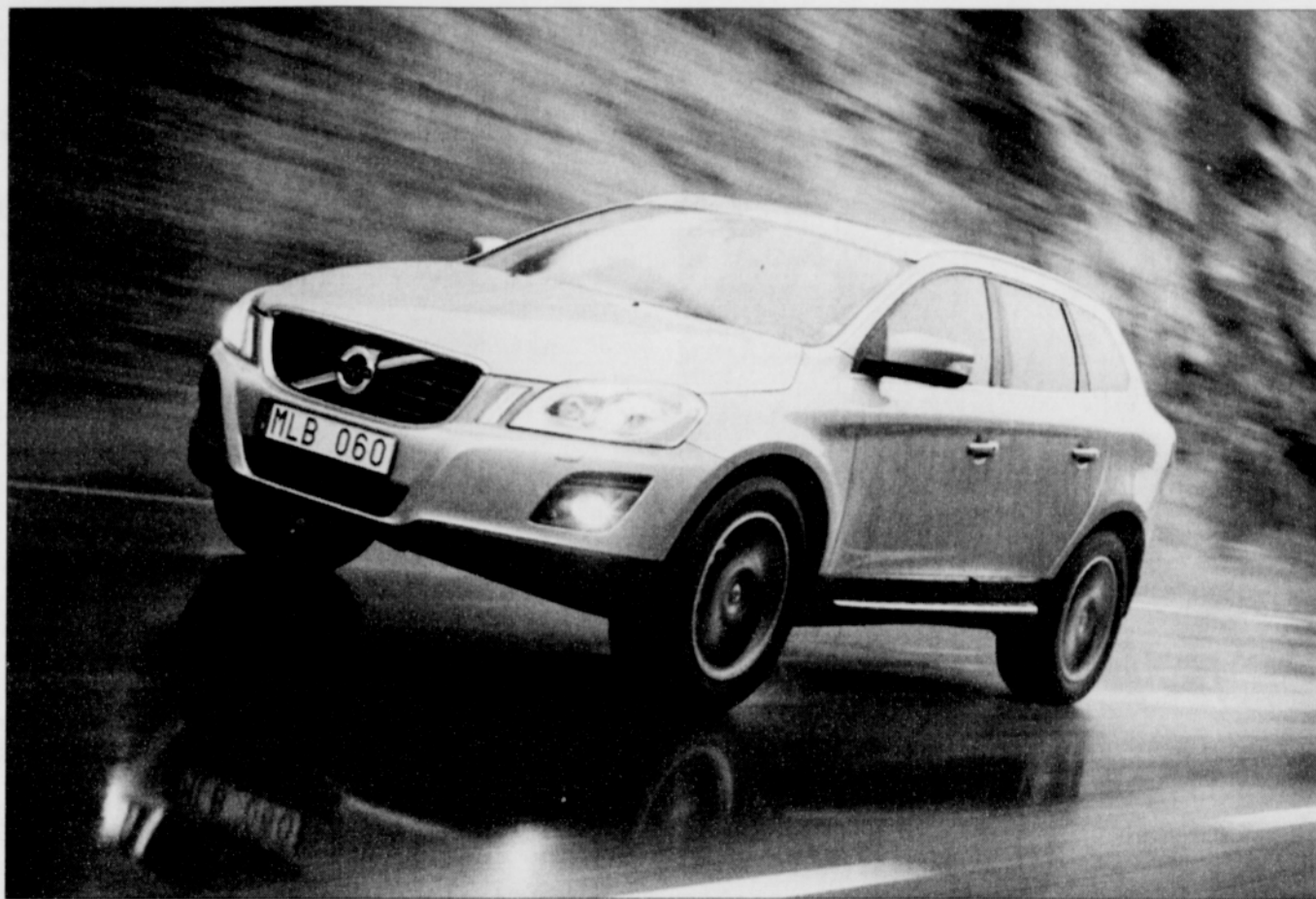
Vehicle Specifications: 3.0 Liter, 6 cylinder alloy engine w/DOHC Continuous variable timing; Geartronic 6 speed transmission w/Adaptive Shift Logic; 16 city mpg, 22 highway mpg; MSRP $44,240.

It comes with the same transversely-mounted 3.0-liter turbocharged inline-6 as found in T6 versions of the XC70 and S80. That means 281 bhp and best-in-class torque of 295 lb.-ft., the latter from 1500-4800 rpm. This super-smooth engine is mated to a 6-speed Geartronic automatic, the power put to the road by Haldex's fourth generation all-wheel drive with Instant Traction. The MPG on this vehicle is low, however the T6 engine was designed to run on cheaper regular gasoline, as opposed to premium like most