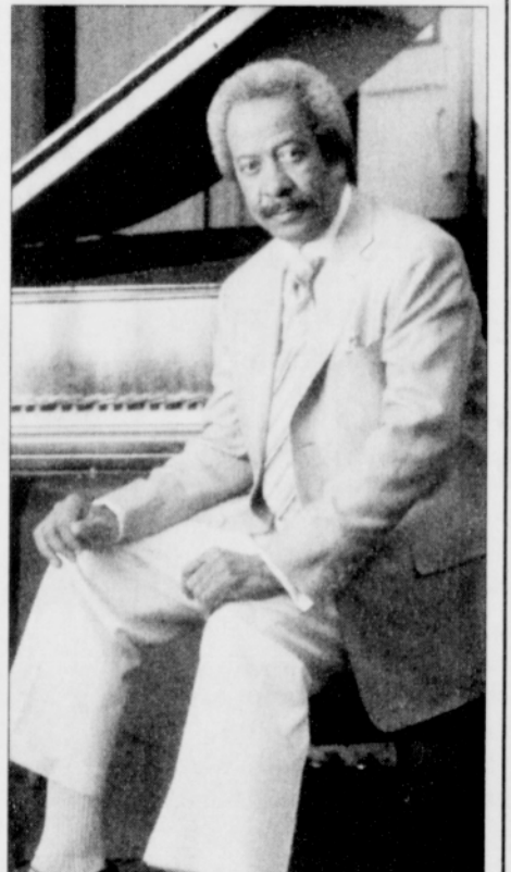
Singer, pianist, songwriter, arranger and producer Allen Toussaint.

"The Festival is almost a sensory overload of music, art, wine and food" says Dr.