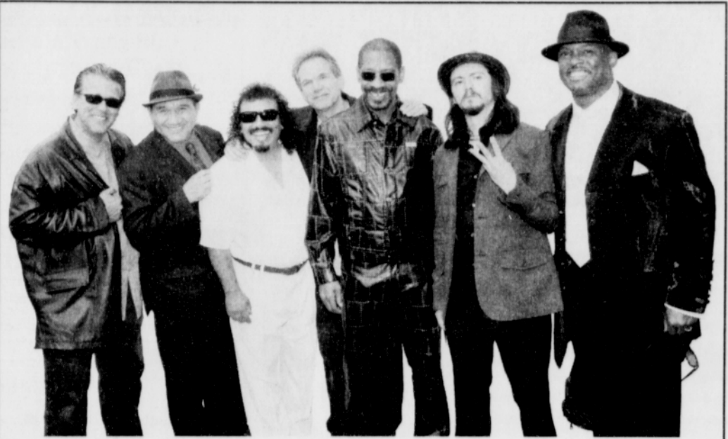
The multicultural musical crossover band War will bring its rock, funk, jazz, Latin music, R&B and reggae to this weekend's Vancouver Wine and Jazz Festival.

For more information, contact the Clark County Historical Museum at 360-993-5679 or visit cchmuseum.org .