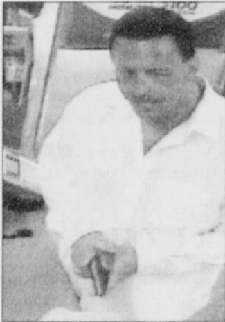
A theft suspect is captured on surveillance video.

Over the past few weeks, the Vancouver Police Department has taken several reports of auto prowls in the area of Vancouver Lake. On Tuesday, July 7 at approximately 1 p.m., someone broke into a parked vehicle at Vancouver Lake and stole a purse. A short time later a lone male used the victim's debit card to make $1,190 in