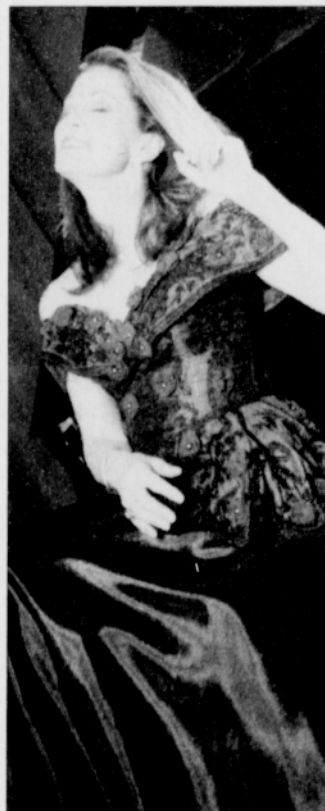
Grammy-award winning singer Rita Coolidge will take the Vancouver Wine and Jazz Festival stage.

General admission tickets are $20 for Friday's lineup and $25 for Saturday and Sunday. They can be purchased online at ticketswest.com or by calling 503-224-8499 or 1-800-992-8499.