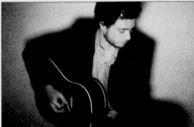
Soulful, sophisticated Amos Lee will close out the Summer Zoo Concert Series on Friday, Aug. 28

Lee hails from Philadelphia, where he caught the attention of Norah Jones who offered Lee an opening slot on her 2004 tour. His full-fledged debut album reached No. 2 on Billboard's Top Heatseekers Chart and garnered Lee a spot on Rolling Stone's list of "Top 10 Artists to Watch" for 2005. His most recent release, 2008's