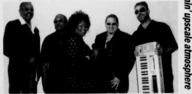
Stammin' upscale atmosphere

OCEAN 503: Aug 13th - Aug 20th & Sept 3rd - Sept 17th