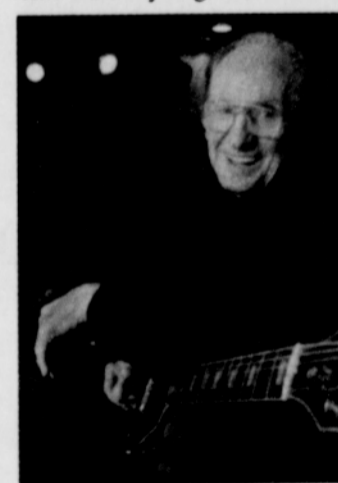
Les Paul changed the course of music with the electric guitar and multitrack recording.

"I went into a nightclub and played it. Of course, everybody had me labeled as a nut." He later put the wooden wings onto the body to give it a tradi-