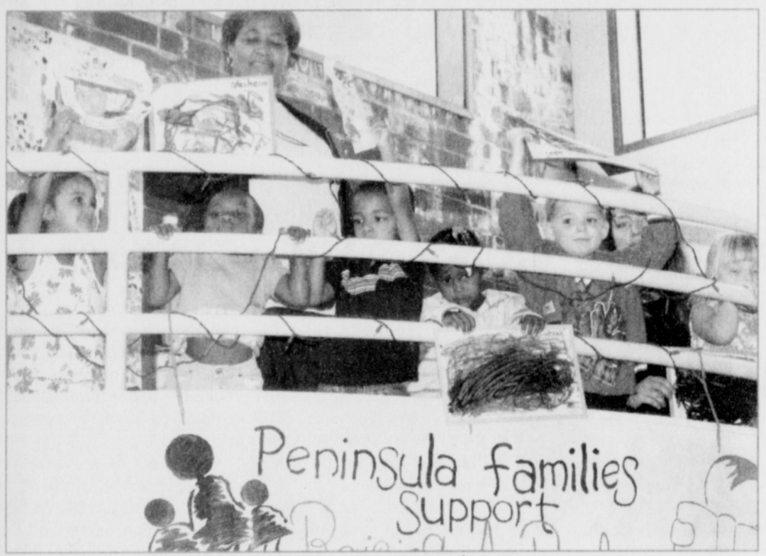
Urban renewal funds provided much needed repairs to the Peninsula School in the Interstate Corridor Urban Renewal Area.