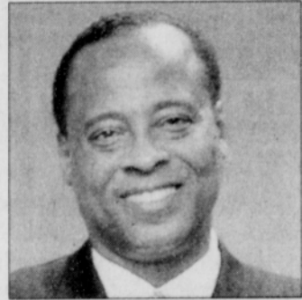
Dr. Conrad Murray

Several Drug Enforcement Administration agents entered