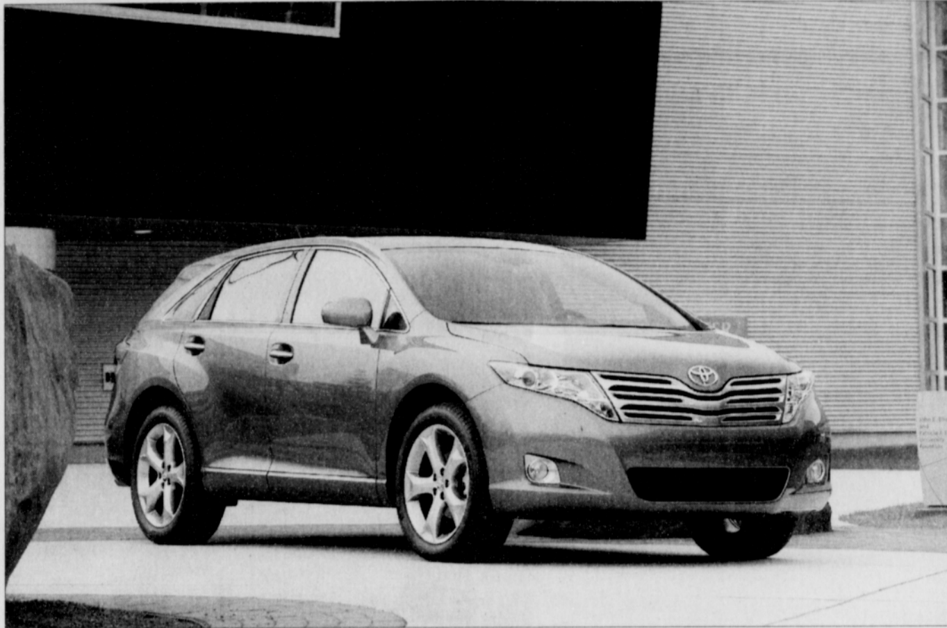
Specifications: 3.5L V6 DOHC 24V w/dual VVT-i; 6 speed automatic ECT-I w/sequential drive; 18 city mpg, 25 highway mpg; MSRP 38,493 ($29,250 w/o optional equipment).

The 2009 Toyota Venza's performance lives up to its car-like underpinnings, offering a