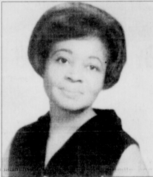
She also was an avid bowler and participated on the Cosmos League, sponsored by Jenkins Auto at Amato Lanes in the early 1970s. In 1975