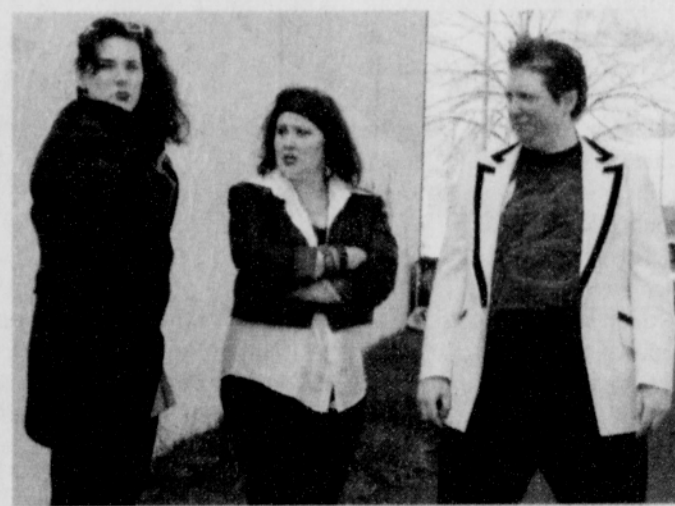
Sketch comedy group Define Naked is celebrating 25 years.