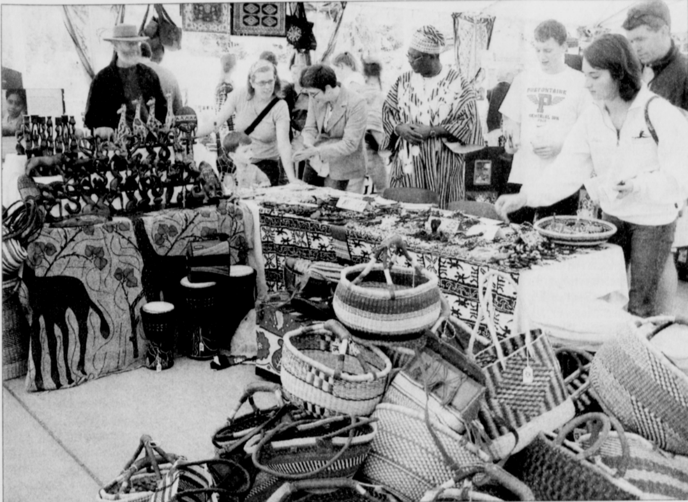
The central plaza of the World Forestry Center at Washington Park is transformed into an African Market for the Day of the African Child, a celebration of diversity.