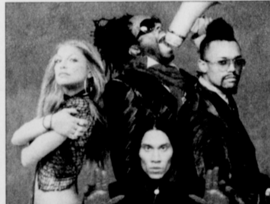
Black Eyed Peas.

Their previous set, 2005's "Monkey Business," bowed at No. 2 with a then-best 291,000. Believe it or not, the Black Eyed Peas have hit the top 10 only twice: their first two releases -- 1998's "Behind the Front" and 2000's "Bridging the Gap" -- both missed the top 50. It wasn't until the group recruited Fergie for "Elephunk" in 2003 that it hit the big time.