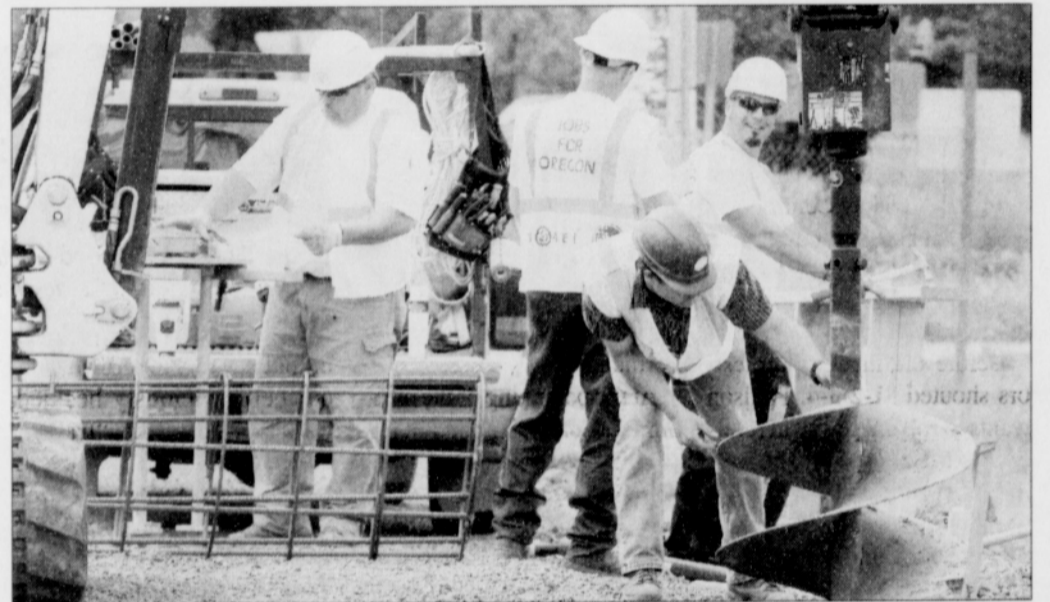
Federal stimulus monies are going to work adding lighting to 7 miles of a busy I-205 bike and pedestrian corridor.

ODOT supports the participation of disadvantaged, minority, women and emerging small business enterprises, as well as opportunities for trainees and apprentices, on highway construction projects.