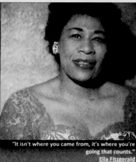
"It isn't where you came from, it's where you're going that counts." Ella Fitzgerald

A quarter century of Jazz and Blues; 25 years is a long time, a milestone... If you enjoy the music of KMHD 89.1 FM please consider supporting the station. We need your support to continue playing the jazz and blues music you love. With your faith and monetary support KMHD will be around for 25 more!