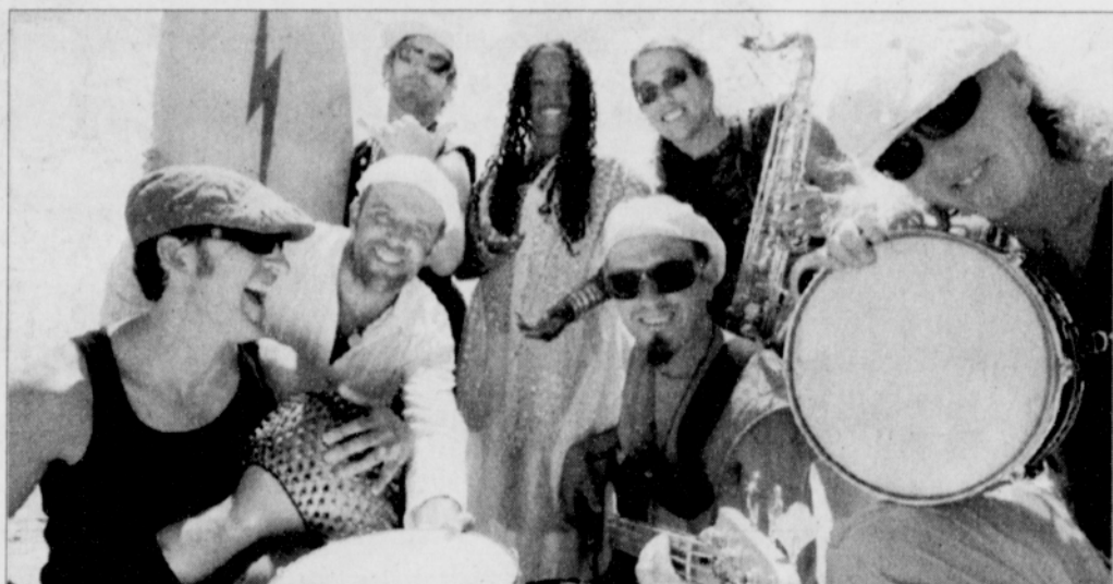
The band SambaDá blends South and Central American samba and salsa with good old funk and reggae. The group will perform in Portland Friday, June 5 at Someday Lounge, 125 N.W. Fifth Ave.