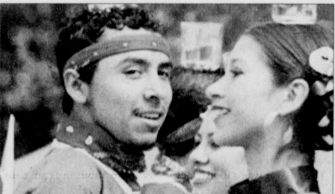
Live music and folk dancing will be part of the fun at Explorando el Columbia Slough!

¡Celebremos la naturaleza en la ciudad y el ambiente del Columbia Slough! Este festival bilingüe de la familia y el medio ambiente ofrece actividades en español y inglés para todos las edades. Explorando es gratis y incluye: viajes en canoas con una guía, música en vivo, baile