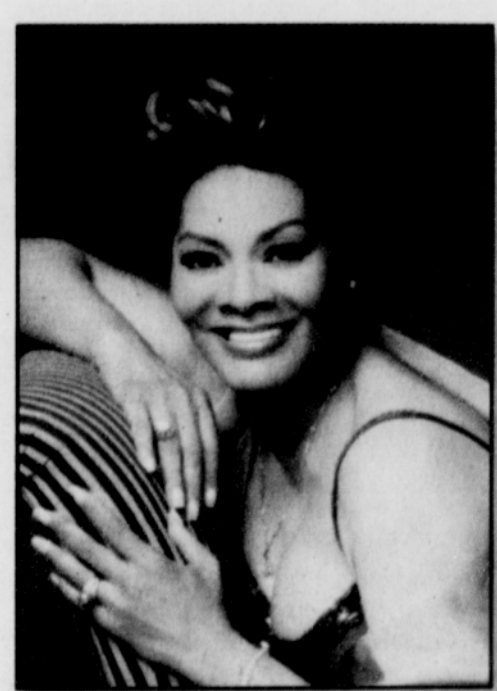
DIONNE WARWICK FRIDAY, JUNE 5th Tickets are $25 & $30

Spirit Mountain's spectacular Event Center features headliner concerts, comedy and live sporting events.