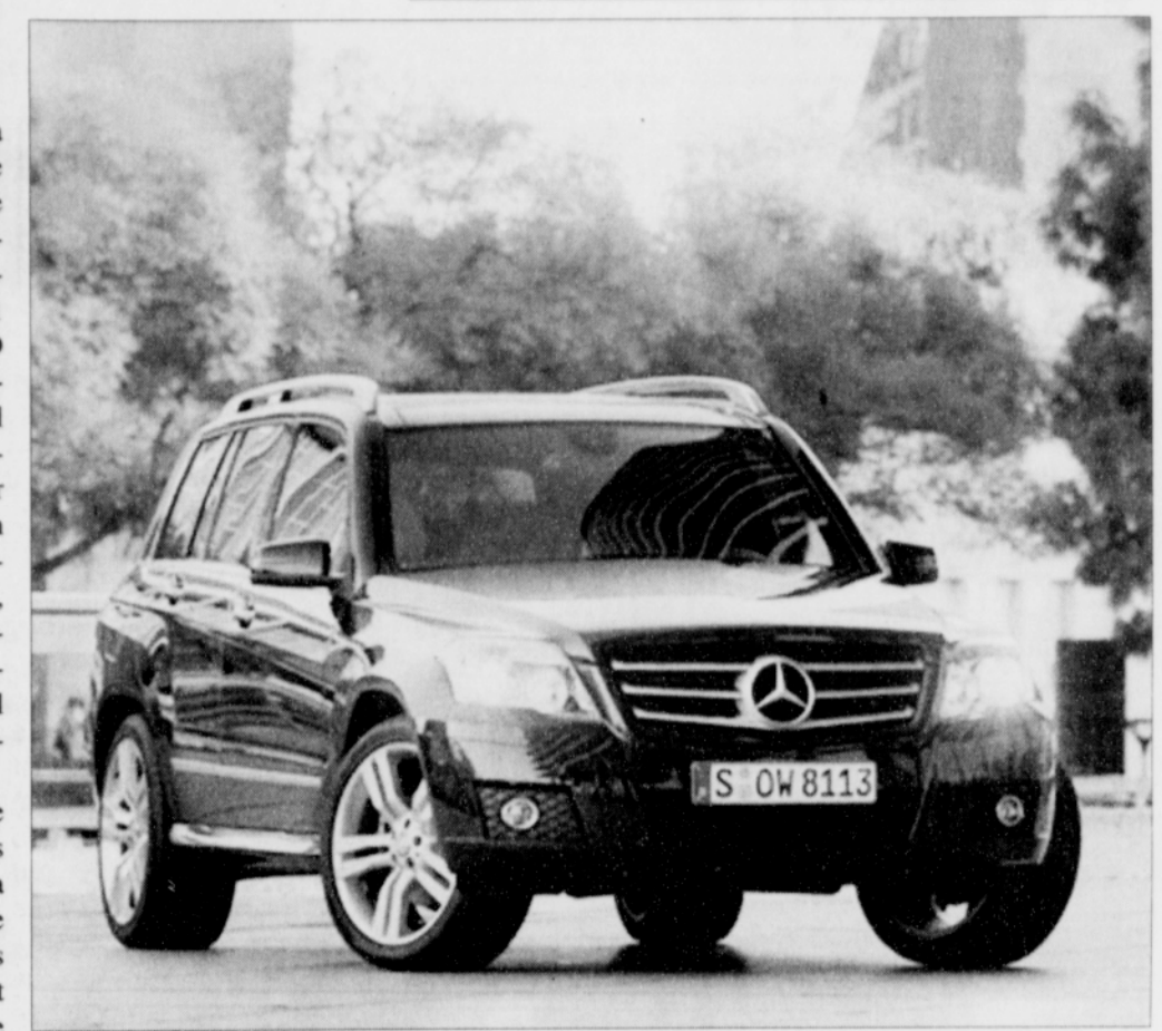
Vehicle Specifications: 3.5L V6 24-Valve gasoline engine; Seven speed driver adaptive automatic transmission; 15 city mpg, 20 highway mpg; MSRP $45,685.

The GLK350W leaves me with mixed feelings. It has the precise and handling of a Mercedes- Benz, but from the side view of this view lacks the premium style. It does not stand out as a Mercedes the look of it was just lacking throughout the vehicle.