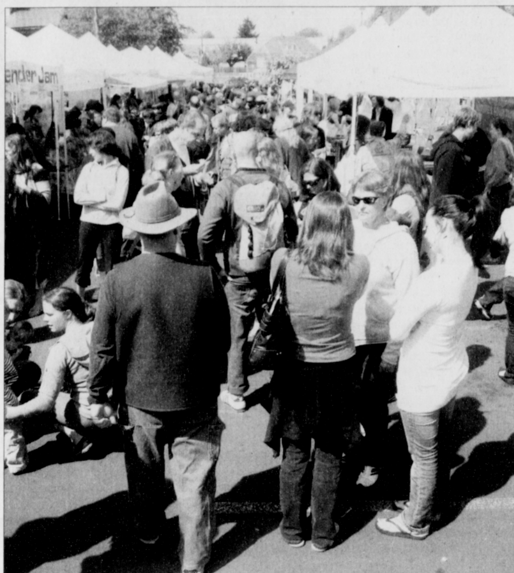
Big crowds fill opening day at the Portland Farmers Market at the King Neighborhood Facility next to King School Park. The Sunday market will be expanding as the growing season gets underway. Hours are each Sunday from 10 a.m. to 2 p.m. through Sept. 27

"Food is what brings us together, around the dinner table, at the community potluck, during school lunch. We all must eat to live and nourish one an-