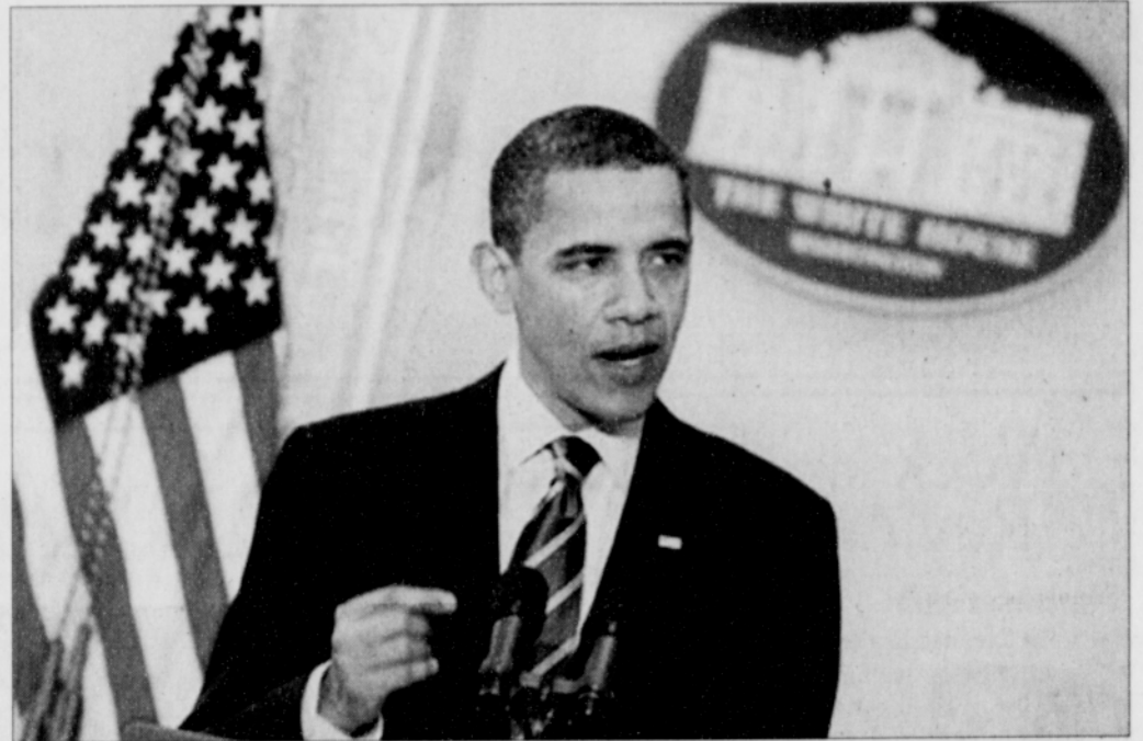
President Barack Obama speaks about jobs and revamping the unemployment system by offering job training to displaced workers.

State governments, not Washington, decide who is eligible for unemployment, and they generally require anyone collecting assistance to be actively looking for work. That