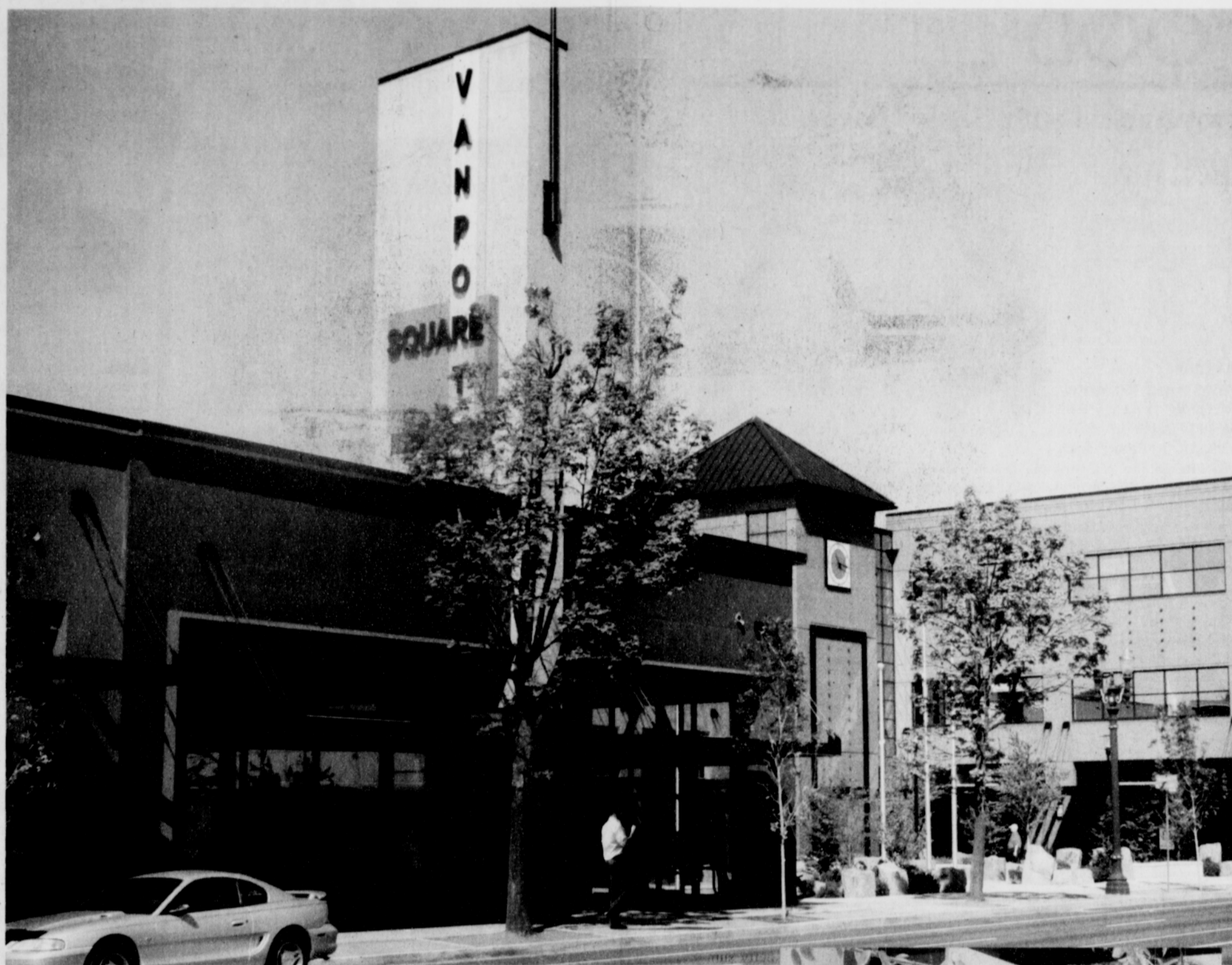
Vanport Square opened in January 2008 and features 14 local businesses – each of which owns their space. The project recently achieved Leadership in Energy and Environmental Design (LEED) Gold certification for its environmentally sustainable construction. The project was developed by Vanport Partners, LLC and was jointly funded by PDC and the Portland Family of Funds.