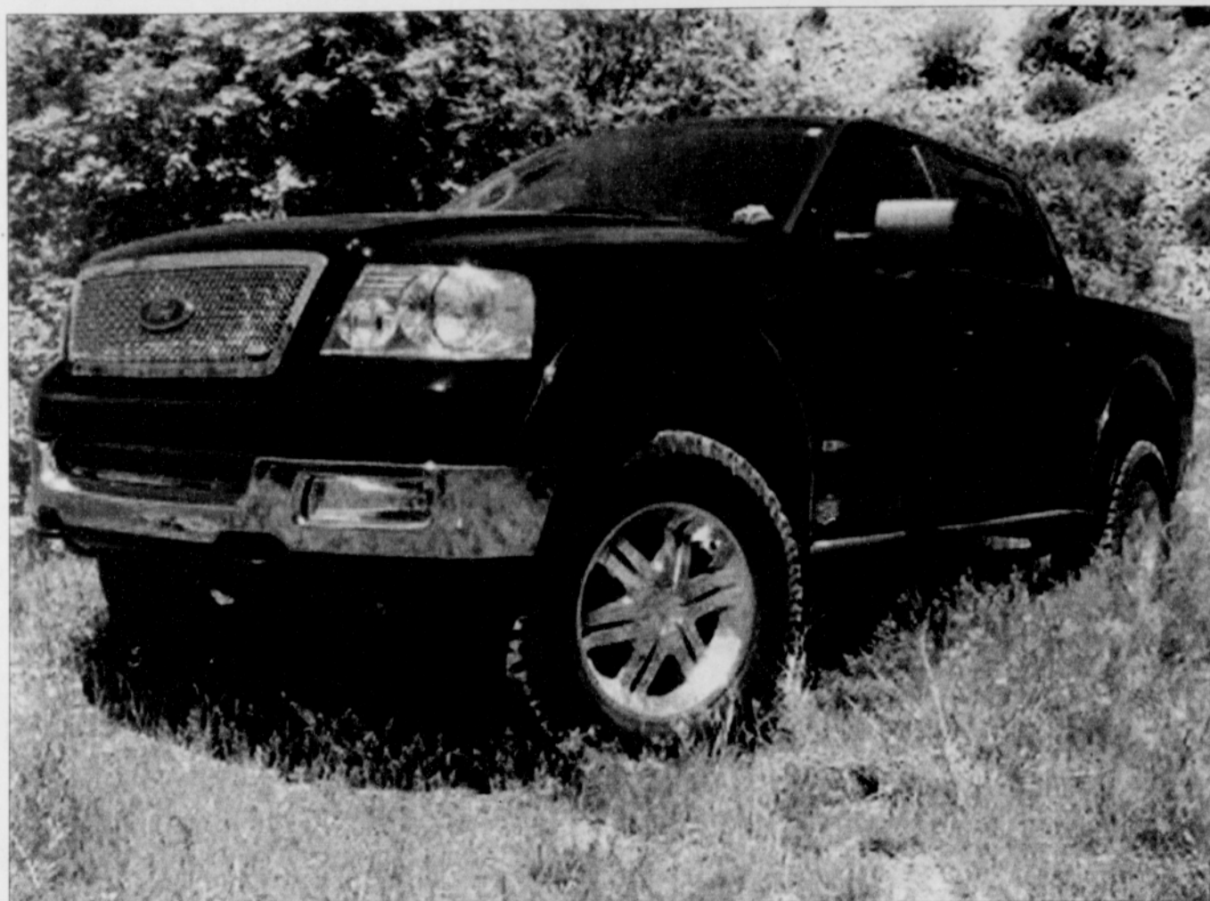
Vehicle Specifications: 5.4L FFV V6 engine; Electronic 6-spd automatic transmission; 14 city mpg, 18 highway mpg; MSRP $46,410.

Ford has stuck traditional rear leaf springs, though they have been stretched and lengthened