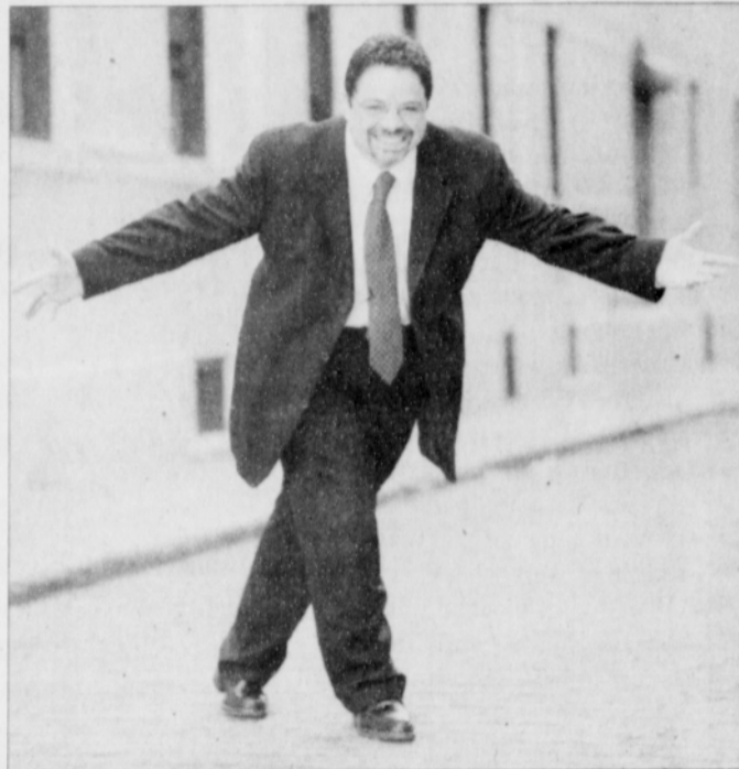
Latin Jazz artist and Grammy winner Arturo O'Farrill, son of legendary composer and jazz trumpeter Chico O'Farrill, will perform in Portland for Afro-Latin night with the Portland Jazz Orchestra.

show is made possible by a grant from the Regional Arts and Culture Council.