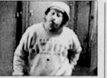
Ace Tavern security video shows a man suspected of using a knife to rob the tavern, located at 8868 N.E. Sandy Blvd.