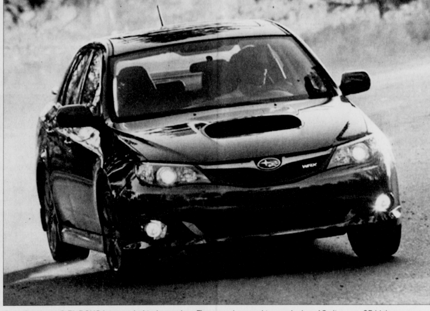
Specifications: 2.5L DOHC inter-cooled turbo engine; Five speed manual transmission; 18 city mpg, 25 highway mpg; MSRP $30,190

Just one engine powers the Subaru Impreza WRX: the trademark horizontally opposed (flat) four-cylinder. At 2.5 liters and with 16 valves and dual overhead cams, the engine features a larger turbo for '09 that puts out an additional 41 horses for a total of 265 hp. The WRX receives upgraded suspension, bigger wheels and tires and aerodynamic body changes, and is available only with a 5-speed manual transmission, making the WRX quicker and more fun to drive than ever. The well-spaced ratios of the manual transmission's five gears capitalize on the power