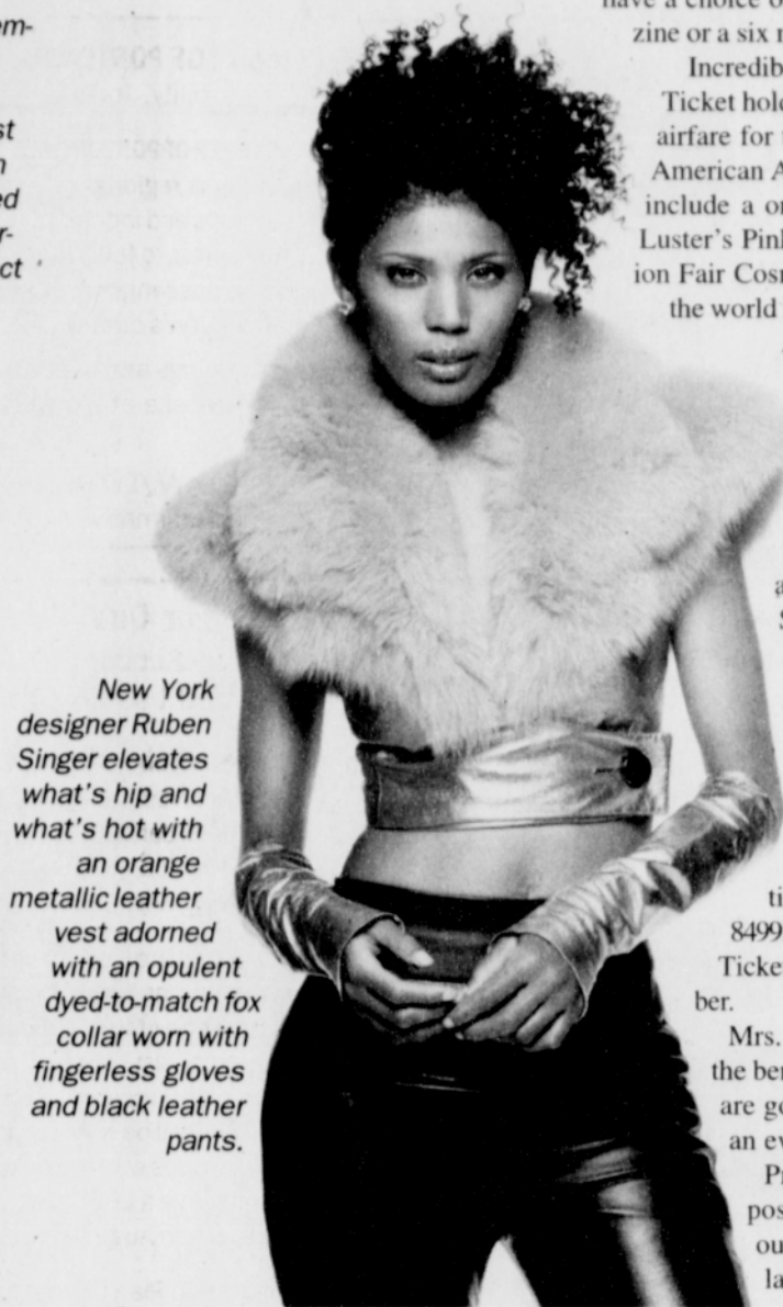
New York designer Ruben Singer elevates what's hip and what's hot with an orange metallic leather vest adorned with an opulent dyed-to-match fox collar worn with fingerless gloves and black leather pants.

have a choice of one-year subscription to Ebony magazine or a six month subscription to Jet magazine.