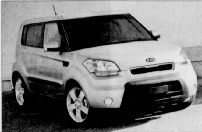
Specifications: 2.0 16 valve DOHC CVT 4 cylinder engine; 5 speed manual transmission; 24 city mpg, 30 highway mpg; MSRP $18,345

The Sport model, feels light on its feet and surprisingly well-planted in high-speed turns. However, the hydraulic power steering is unremarkable, offering a numb on-center feel and a nonlinear effort. Around town, the Soul is decently comfy, but on the highway, the ride quality can be a bit choppy. The upper