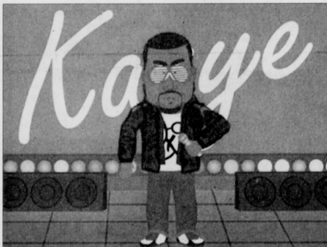
In this animated still released by Comedy Central, a cartoon version of rapper Kanye West is shown on an April 8 episode of the Comedy Central animated series, 'South Park.'

And perhaps to show that he's really serious about making that change, he provided a link to one of the most biting moments from the "South Park" show, and thanked the writers as well.