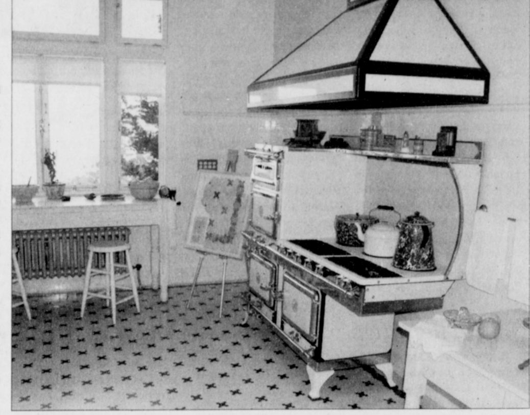
The Pittock Mansion's period authentic kitchen is one of the locations for a Kitchen Revival Tour on Saturday, sponsored by the Architectural Heritage Center, 701 S.E. Grand Ave.

Homeowners will be on hand to share their experiences. Whether it's the preservation of an original gem, a do-it-yourself restoration, or a renovation completed under the guidance of a local contractor, the Kitchen Revival Tour promises to be both educational and entertaining.