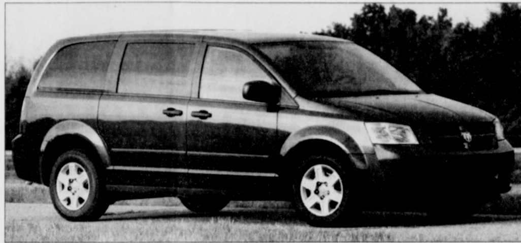
Specifications: 4.0 Liter V6 SOHC engine; Six speed automatic 62TE transmission; 17 city mpg, 25 highway mpg; MSRP $37,880.

The Caravan SXT optional features include a rear DVD entertainment system includes a swiveling second-row flip-down screen. Also optional on the SXT is the Premium Group that adds rain-sensing wipers, automatic climate control, a power-folding third-row seat, an auto-dimming rearview mirror, uconnect Bluetooth phone connectivity