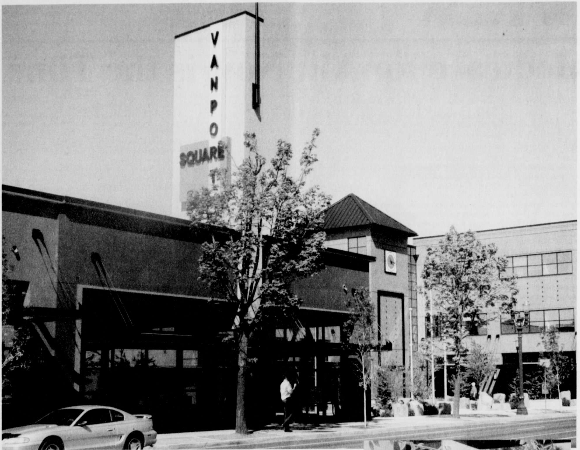
Vanport Square opened in January 2008 and features 14 local businesses – each of which owns their space. The project recently achieved Leadership in Energy and Environmental Design (LEED) Gold certification for its environmentally sustainable construction. The project was developed by Vanport Partners, LLC and was jointly funded by PDC and the Portland Family of Funds.