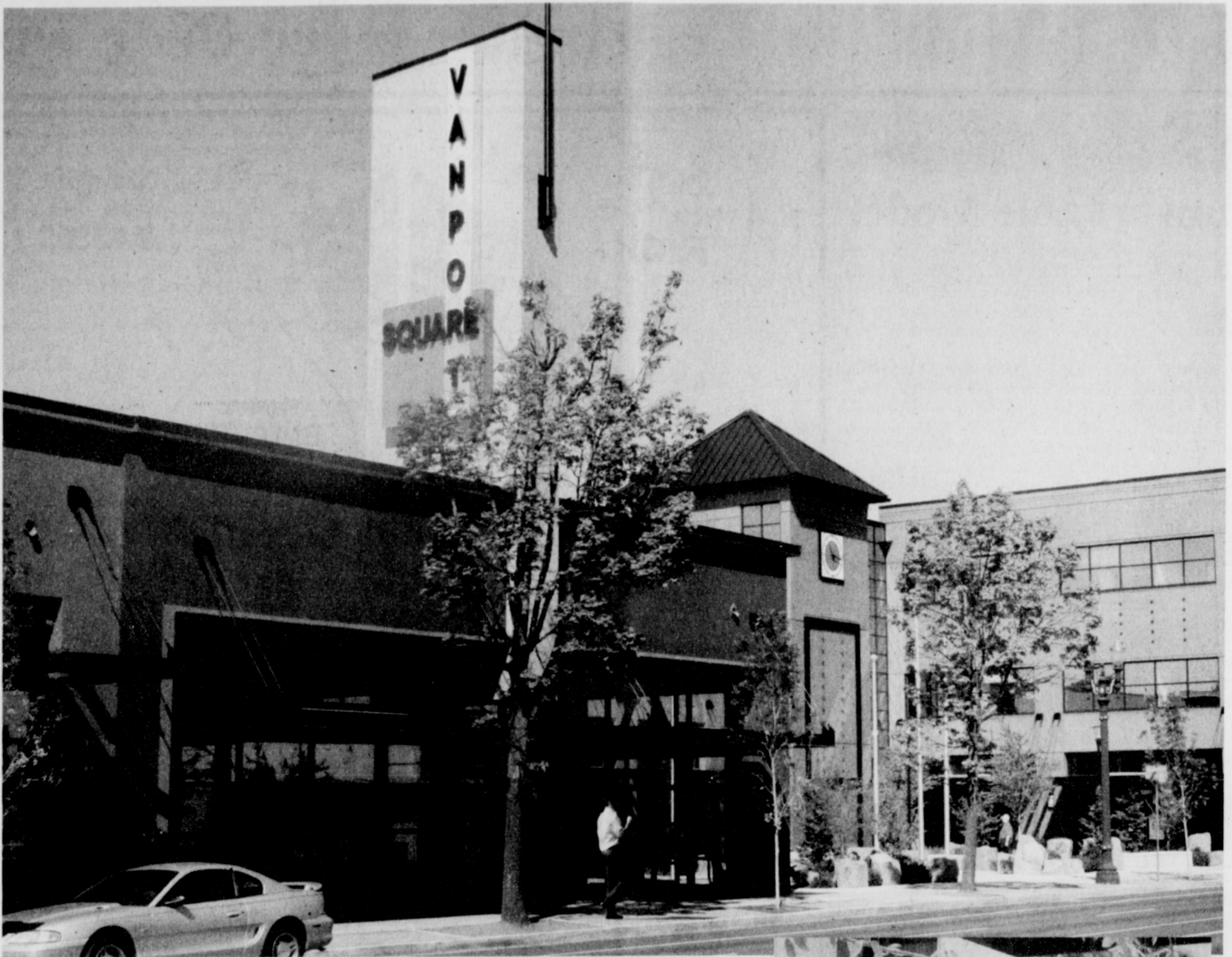
Vanport Square opened in January 2008 and features 14 local businesses – each of which owns their space. The project recently achieved Leadership in Energy and Environmental Design (LEED) Gold certification for its environmentally sustainable construction. The project was developed by Vanport Partners, LLC and was jointly funded by PDC and the Portland Family of Funds.