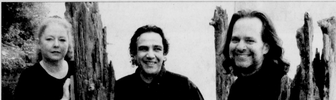
The classic group Al Andalus bridges cultures from East to West.

Music legends Earth Wind & Fire will be performing in Portland July 18 at the Rose Garden. Tickets went on sale Monday. The performance will include the legendary band Chicago. The same two groups, teamed up for a concert series five years ago that was phenomenal.