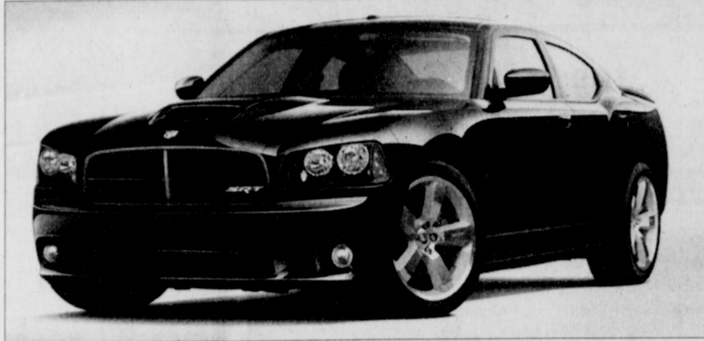
Specifications: 3.5 Liter High output 24-valve V6 MP engine; five speed automatic transmission; 17 city mpg, 23 highway mpg; MSRP $29,490

The SXT upgrades with an eight-way adjustable power driver's seat, leather-wrapped steering wheel and shift knob, 60/40 split folding rear seat with fold-down center armrest, Bos-