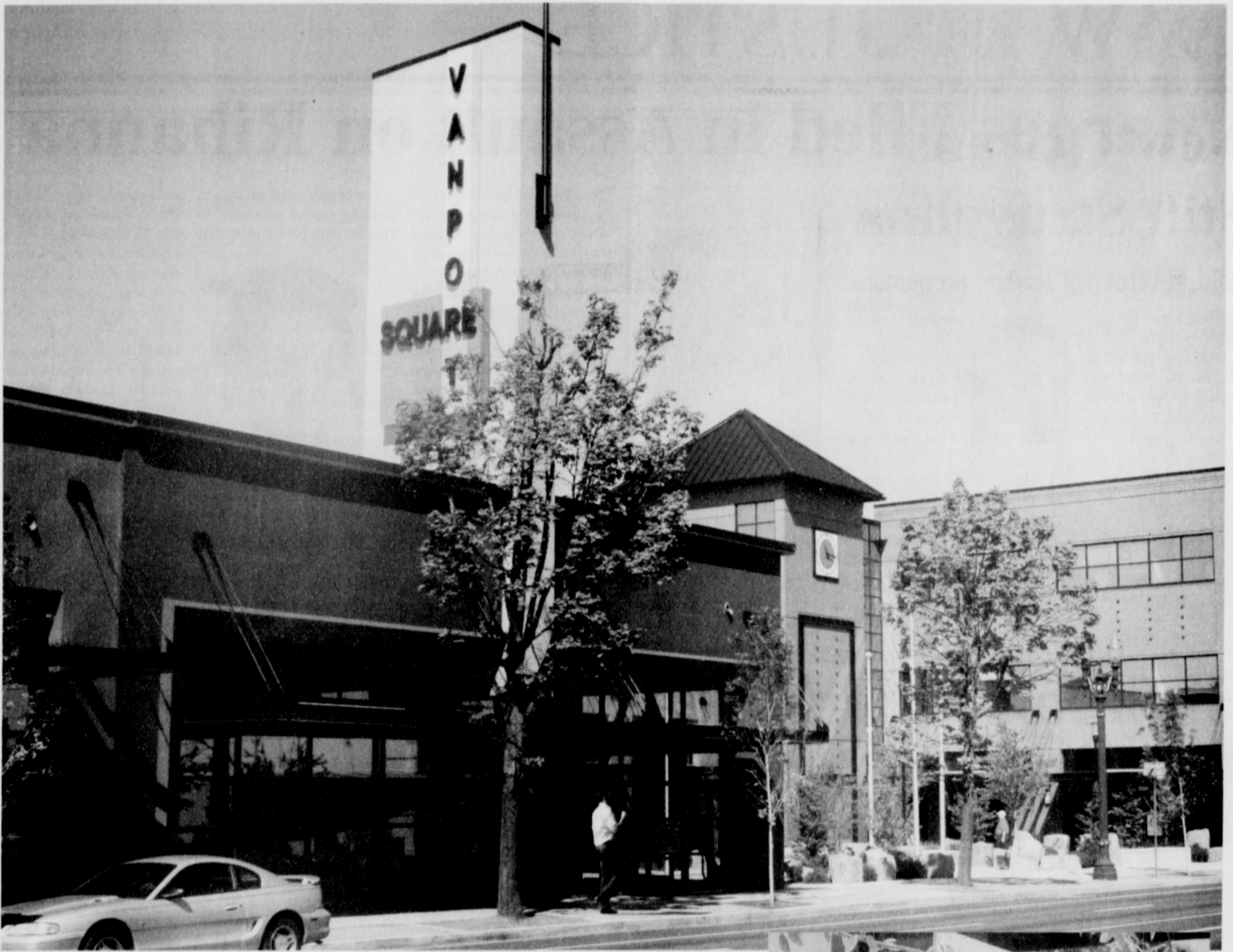
Vanport Square opened in January 2008 and features 14 local businesses – each of which owns their space. The project recently achieved Leadership in Energy and Environmental Design (LEED) Gold certification for its environmentally sustainable construction. The project was developed by Vanport Partners, LLC and was jointly funded by PDC and the Portland Family of Funds.