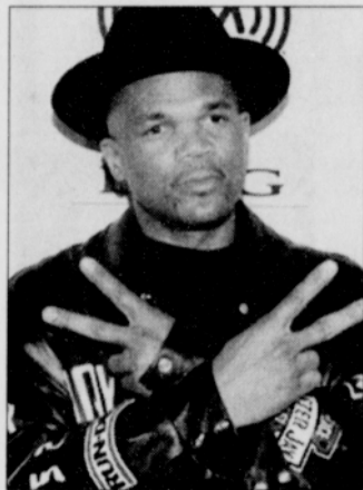
Darryl 'DMC' McDaniels