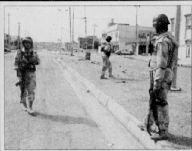
Iraqi army soldiers patrol Mosul after a U.S. soldier was killed and three others were wounded in a shooting in 2008 at an Iraqi police station.