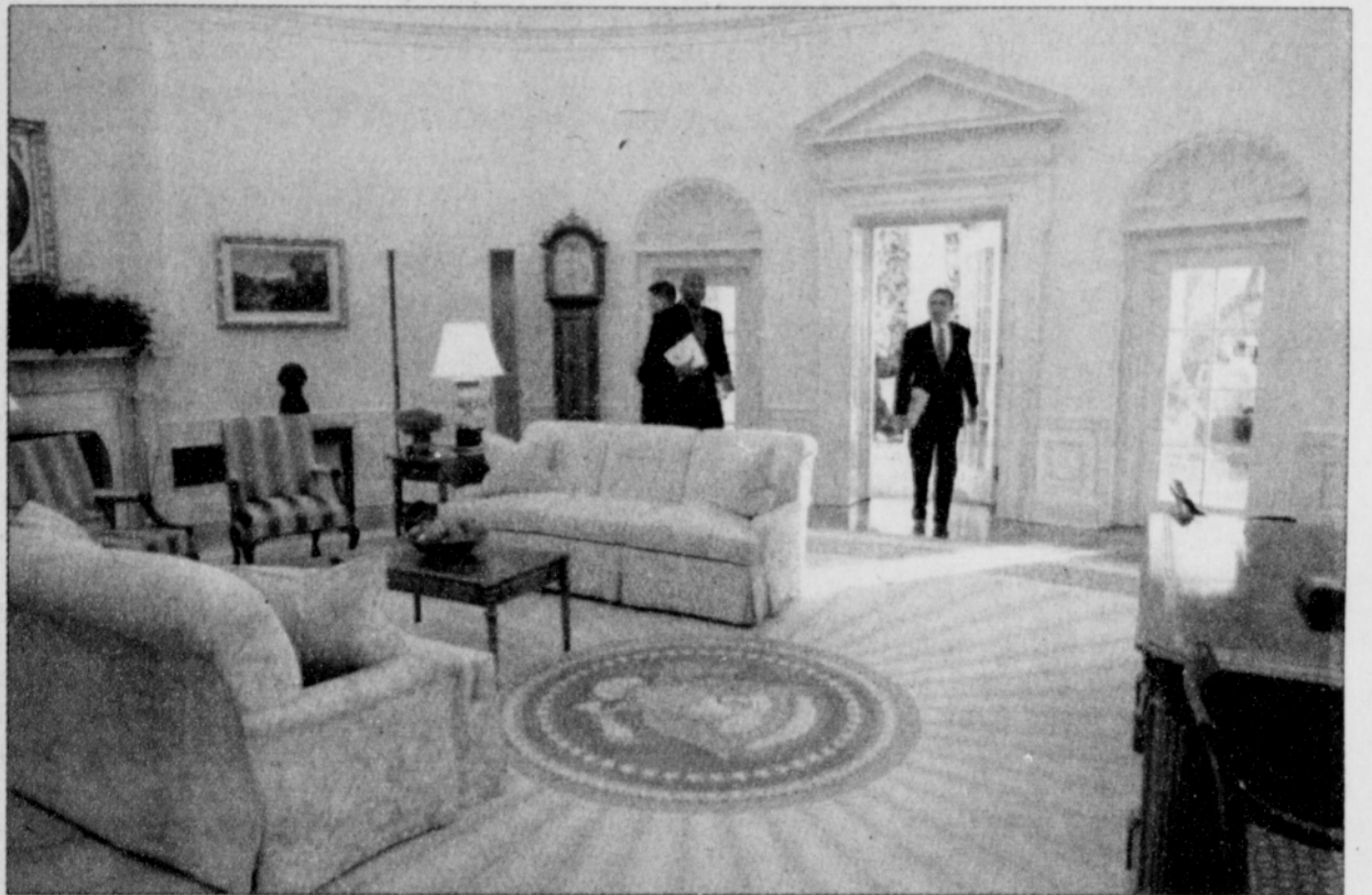
Barack Obama enters the Oval Office of the White House on his first day as President of the United States of America.

This was the presence of history being recorded and there was nothing I could say that hadn't already been said -