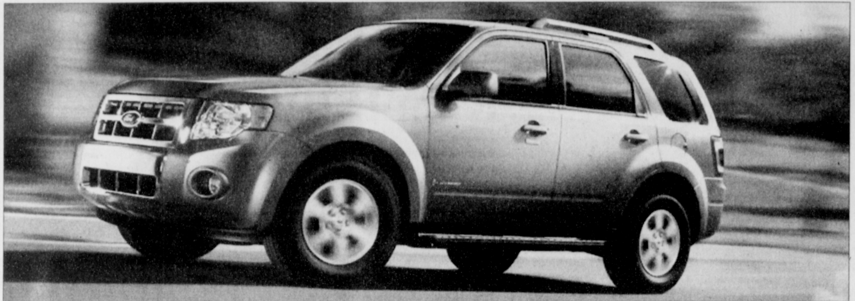
Specifications: 2.5L I4 Atkinson cycle engine; ECVT automatic transmission; 34city mpg, 31 highway mpg; MSRP $29,645.

The Escape Hybrid is the most fuel-efficient model, but it's also the heaviest, by 300 lbs. It uses a new, larger 2.5-liter four-cylinder engine linked to an electric motor. The net result is virtually guilt-free acceleration similar to that of a V6. As a full hybrid, the Escape Hybrid can provide truly guilt-free operation by running solely on electric power in low-load conditions. The Hybrid uses a continuously variable transmission, also known as a CVT that optimally matches the power and gearing. Standard safety features include front and side airbags for the front seats and side-curtain airbags that cover both rows, four-wheel disc brakes, ABS and tire pressure monitoring. The Hybrid also offers a convenient AC outlet for powering small devices such as a laptop.