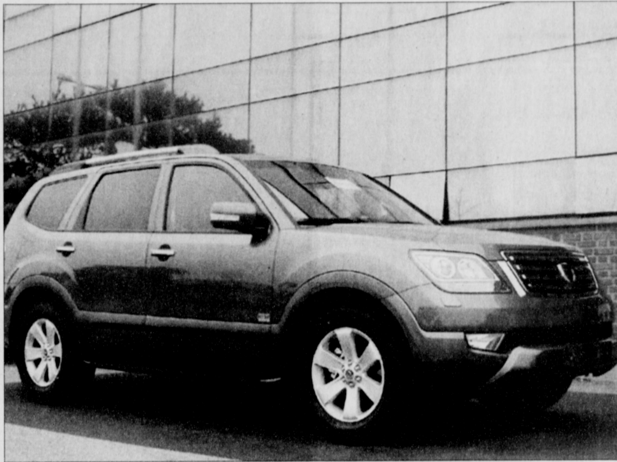
Specifications: 3.8L 24 valve DOHC V6 engine; 5-speed automatic transmission; City 16 mpg, 21 Highway mpg; MSRP $36,295.

The 2009 Kia Borrego is up against long-running, top-selling midsize standbys such as the Ford Explorer, Toyota 4Runner and Nissan Pathfinder. The Borrego has a slightly lower base price than these competitors, and offers all the necessities for an active family, such as a 60/40-folding second