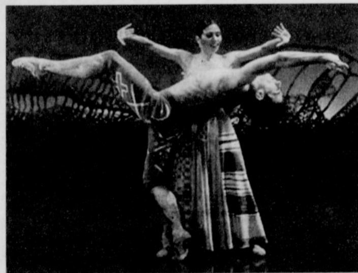
Classical ballet and West African culture merge in "Lambarena."