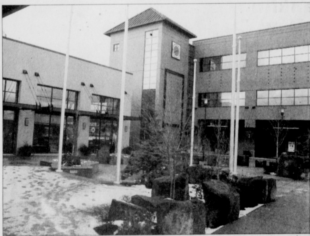
Vanport Square, the new minority-owned development on Northeast Martin Luther King Jr. Boulevard, has earned certification for its environmentally sustainable construction and energy efficiency.

He is also an advocate and the namesake of the Muhammad Ali Boxing Reform Act, a federal law that regulates professional boxing to protect athletes from unscrupulous promoters, as well as poor health and bout conditions. He has appeared before committees of the U.S. Senate several times regarding boxing reform.