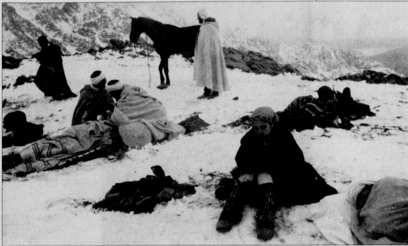
'Zaina: Rider of the Atlas,' a beautiful, timeless tale from Morocco about a girl who discovers her power and her destiny alongside the horsemen of the Atlas mountains, opens this year's Cascade Festival of African Films on Friday, Feb. 6.