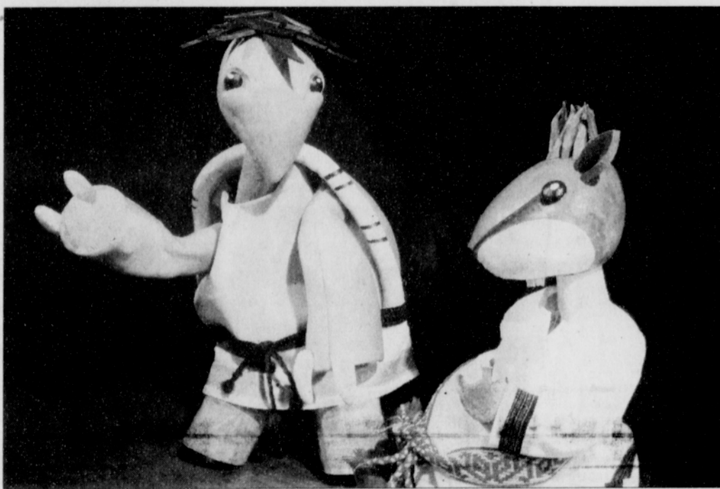
A turtle and squirrel are two of the lovable characters in "When Animals Were People," opening Friday, Feb. 6 with shows continuing through Feb. 28.

When Animals were People opens Friday, Feb. 6 at 7:30 p.m. at Dolores Winningstad Theatre, 1111 S.W. Broadway. Repeat shows are Saturdays, Feb. 7, Feb. 14 and Feb. 21 at 11 a.m.; and Sundays, Feb. 8, Feb. 15 and Feb. 22 at 2 p.m. and 4 p.m.