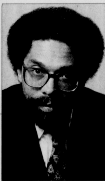
Dr. Cornel West

Sponsored by Portland Community College, the speaking engagement will kick off Black History Month events that follow in Febru-