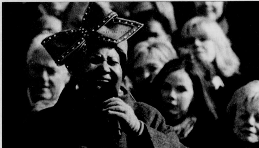
Aretha Franklin and the hat she wore to perform at President Barack Obama's inauguration.

The hat worn by the "Queen of Soul" was hand-molded and would cost upward of $500 — if it were for sale, the 36-year-old designer said. Customers instead were offered a satin ribbon version for $179.