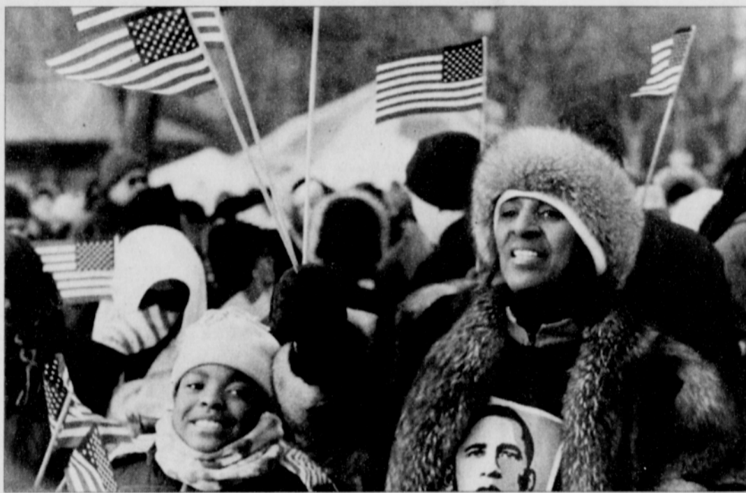
Spectators wave flags as they wait on the National Mall on the morning of the inauguration of Barack Obama as the 44th president of the United States at his inauguration ceremony in Washington, D.C.

who seek to sow conflict, or blame their society's ills on the West—know that your people will judge you on what you can build, not what you destroy."