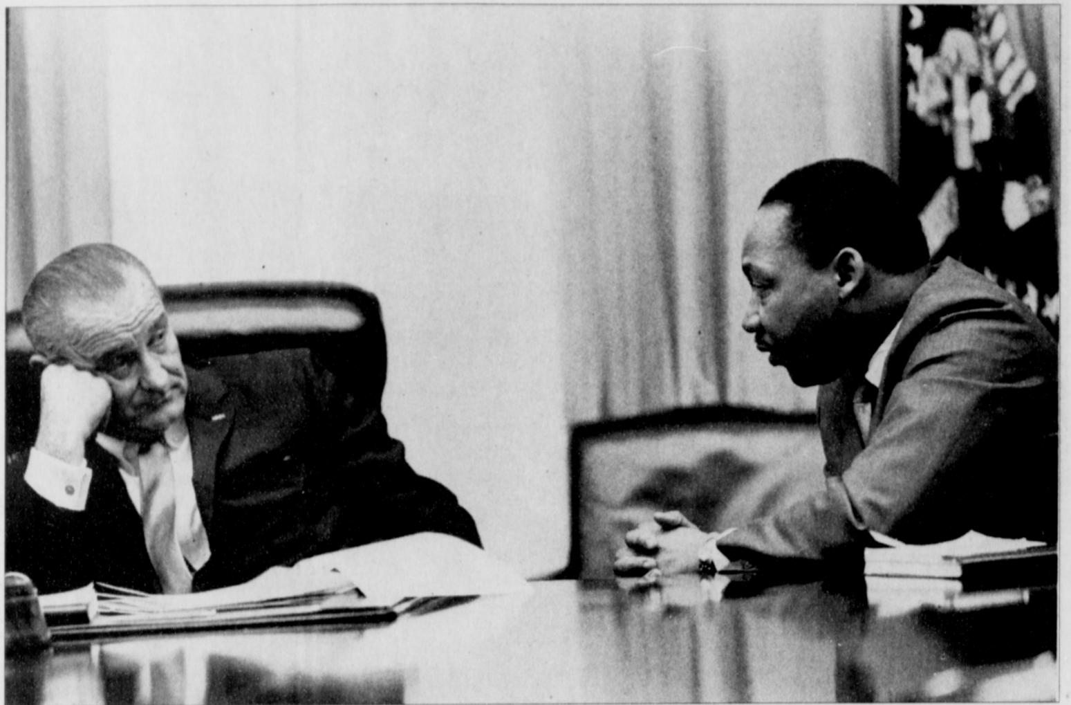
President Lyndon B. Johnson talking with Martin Luther King Jr. in 1963 in the Oval Office of the White House in Washington, D.C.