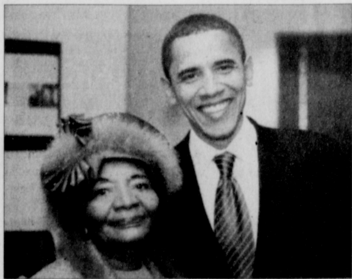
Martin Luther King Jr.'s sister, Christine King Farris, and Sen. Barack Obama in the sanctuary of the Ebenezer Baptist Church on Jan. 20, 2008. Obama visited Ebenezer to worship and offer a few remarks on King.

Through It All, Christine King Farris's first memoir, opens doors to let readers of all ages into her life, her family, and the faith that allows her, in the ninth decade of her life, to still stand for all the principles that make America great.