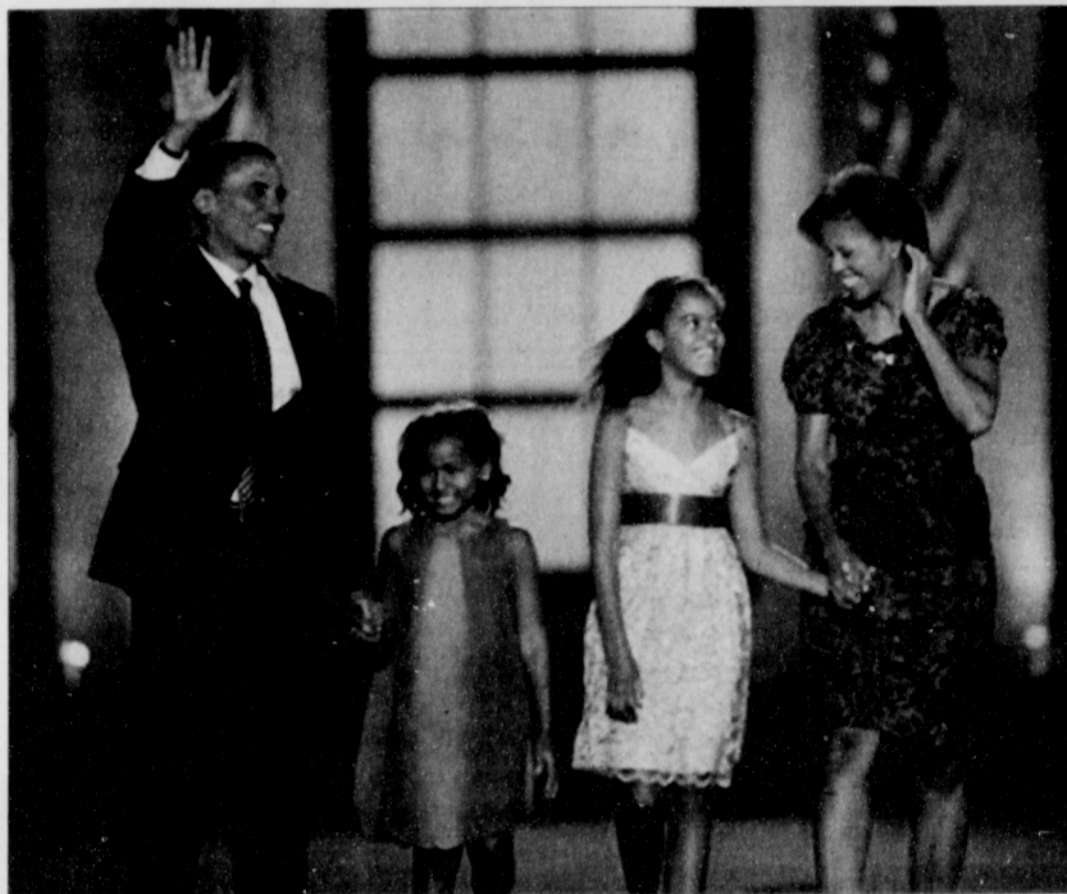
President-elect Barack Obama and his family take the stage during last summer's Democratic National Convention in Denver.

Brian Williams will anchor the daytime coverage for NBC and a live, one-hour special at 10 p.m. that visits several inaugural balls. CBS' Katie