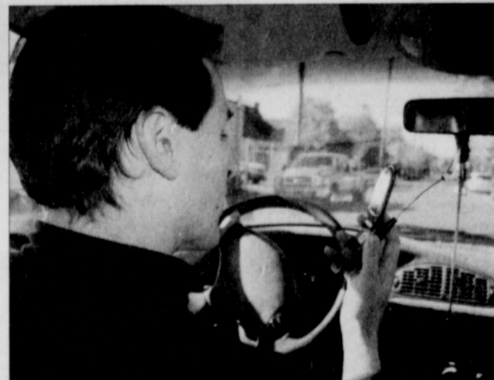
Using a cell phone for dialing and text messaging is a hazard that leads to fatal car crashes, according to the National Safety Council.