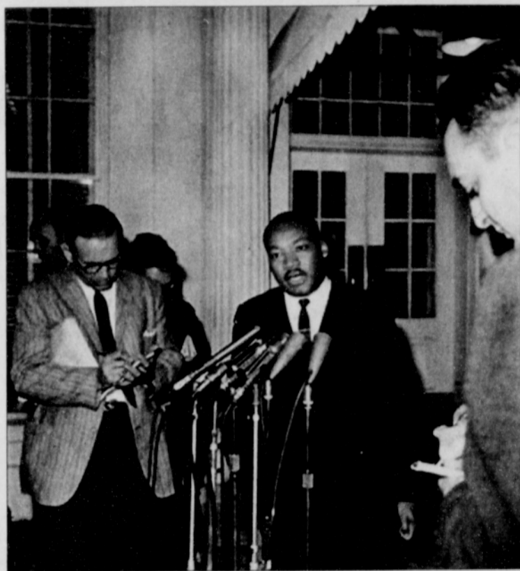
Integration leader Martin Luther King, Jr., talks to reporters outside of the White House in Washington on Oct. 16, 1961 after he presented President Kennedy with a proposal for an executive order to declare segregation unconstitutional under the 14th amendment.

Sponsors include Safeco Insurance Foundation, Portland Public Schools, Portland Association of Teachers, McDonald's of Oregon and Southwest Washington, City of Portland, Dignity Memorial Locations, Oregon Education Association, Enterprise Rent-A-Car, Concordia University, Portland General Electric, African American Chamber of Commerce, KBOO Radio and Portland Community Media and Portland Public Schools Television Services.