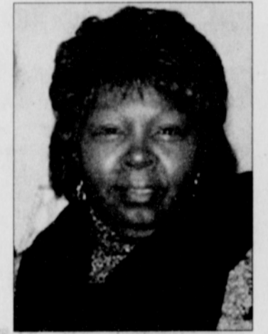
nephews, friends and family. Arrangements by Terry Family Funeral Home.