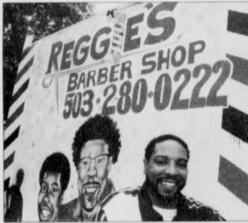
LICENSED BARBER'S WANTED

Ask about our Special - Tightwad Tuesday