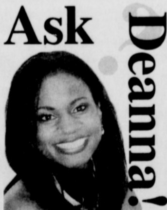
Real People. Real Advice An advice column known for its fearless approach to reality based subjects!

This can be handled through dialogue and communication. Address the issue with your brother first and share your plans with him. Then address the concerns with your sister-in-law as a group. Provide solutions by giving her a directory of names, phone numbers and addresses for every problem she could possibly encounter. Lastly, each of you need to also talk to your spouse as well and issue boundaries in relations to