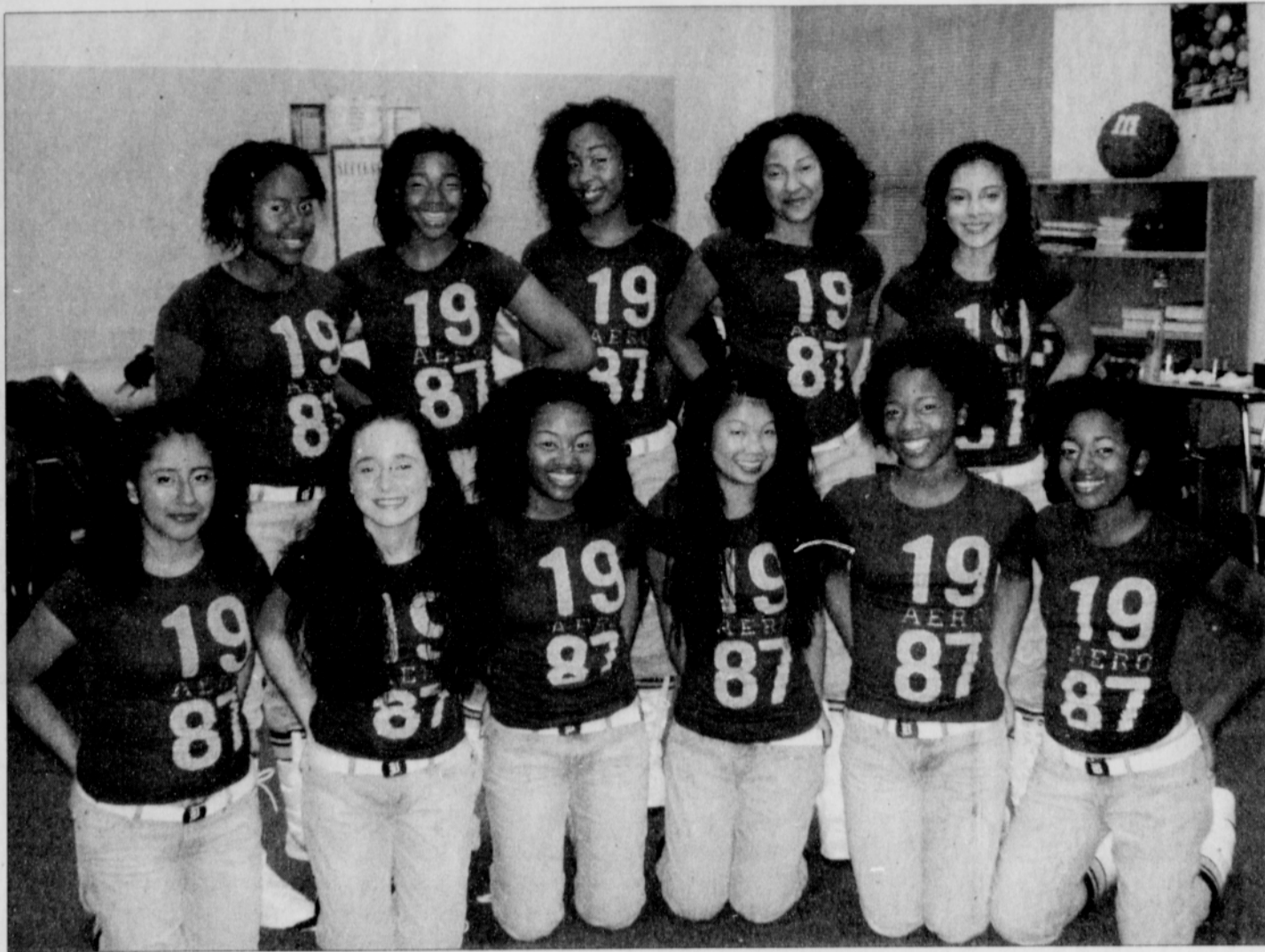
The Benson Dance Team is a committed group of young people working to improve their dance skills, academics and personal lives.