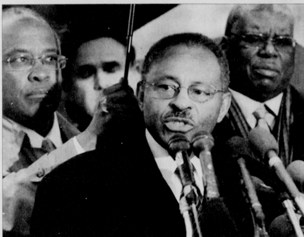
Illinois U.S. Senate Appointee Roland Burris makes a statement Tuesday after departing Capitol Hill in Washington, D.C.

In a scripted bit of political theater, Democrat Roland Burris of Illinois was informed he would not be seated because his paperwork was not in order. He pledged a lawsuit, the latest twist in a