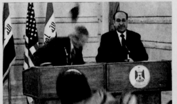
A man throws a shoe at President George W. Bush during a news conference with Iraq Prime Minister Nouri al-Maliki on Sunday in Baghdad. The man threw two shoes at Bush, one after another. Bush ducked both throws.

"This is your farewell kiss, you dog!" the reporter shouted in Arabic while hurling one shoe, and then the other. The reporter was later identified as Muntadar al-Zeidi, a correspondent for Al-Baghdadia television, an Iraqi-owned station based in Cairo,